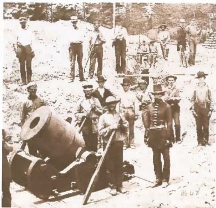
Confederate troops near Pensacola, 1861

was defeated, and federal troops occupied Tallahassee on May 10, 1865.